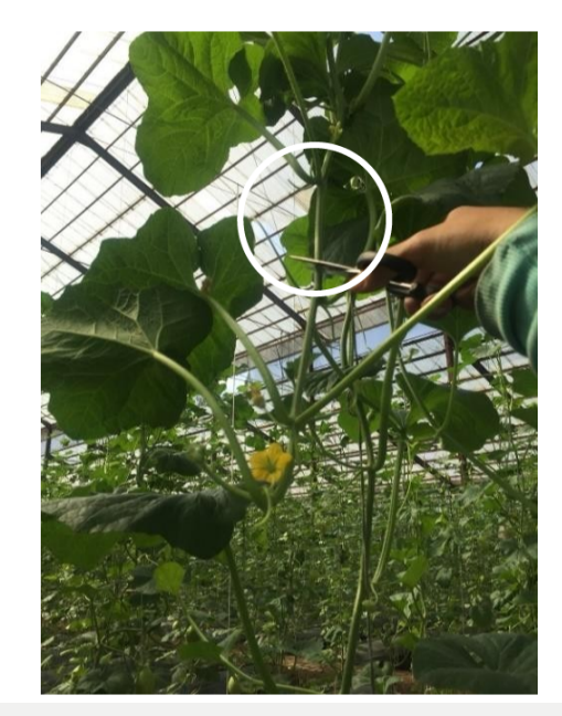
Figure 1 Trimming the top segment of the stem.